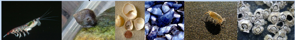
Krill Periwinkles Slipper Snails Mussels Beach Fleas Barnacles

Herbivores: Animals that eat producers .