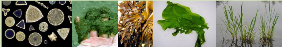
Diatoms Algae Kelp Sea Lettuce Grasses

Plants have chlorophyll which allows them to store energy from the sun in sugar and starch molecules through a process called photosynthesis: