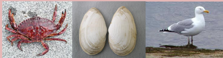
Crabs Clams Sea Gulls

Scavengers: Animals that eat dead or dying animals.