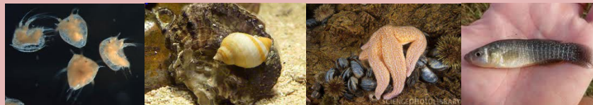
Larvae Dog Whelks Sea Stars Mummichogs

Predators: Animals that eat live animals